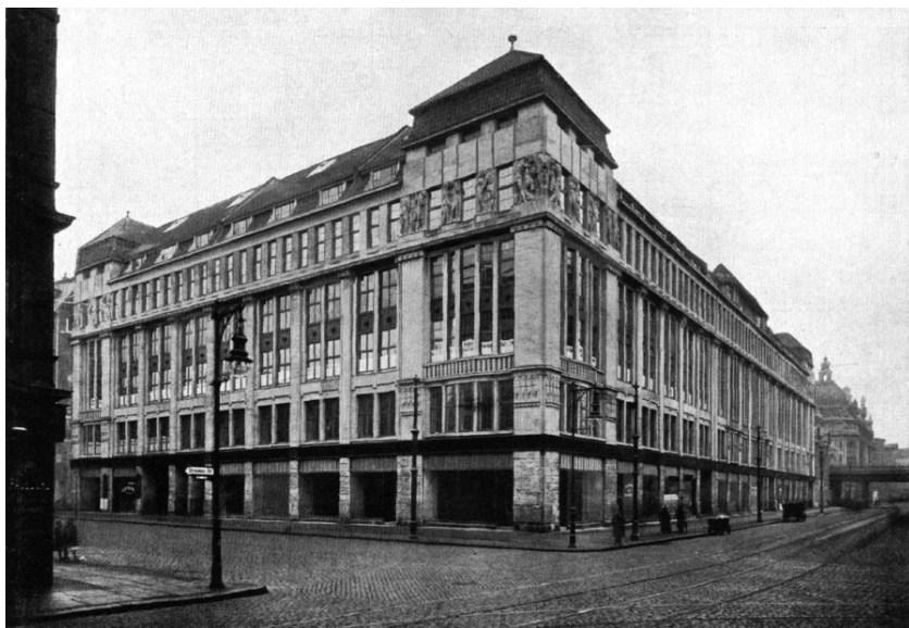
Fig. 2. Schickler-Haus near Alexanderplatz where the MASCH occupied rooms on the first floor.