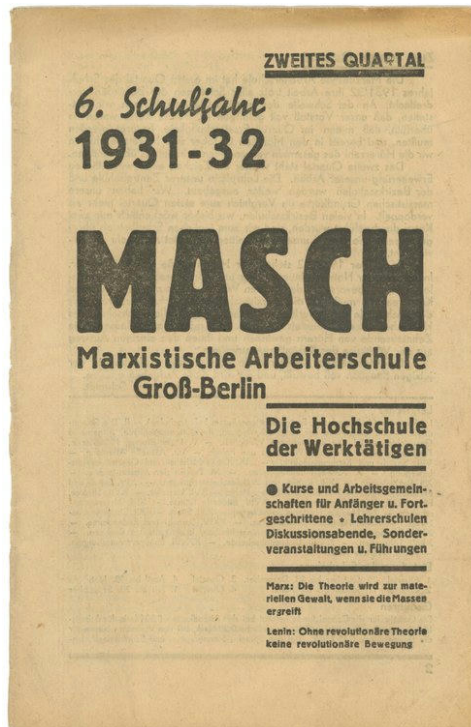
Fig. 6. Programme for the 1931–32 school year announcing “courses and working groups for beginners and advanced learners, teachers’ schooling, discussion evenings, special events and guided tours.” Below are two quotes by Marx (“Theory will become a material force, if it reaches the masses”) and Lenin (“Without revolutionary theory, no revolutionary movement”).

...statistical laws that can be derived with rigour from the previous discussed laws of nature. This is a sublimation of the concept of causality. We still believe in the strict causality or deterministic structure.