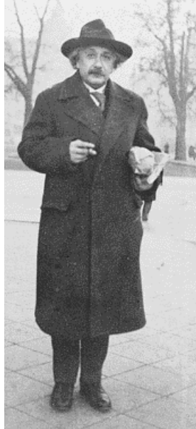
Fig. 4. Einstein in Berlin 1932

Most presumably Albert Einstein (1879–1955) belongs to the small community of highly known and venerated people in human history whose ideas are still subject to amazement and intense debate. 9 Today he still is seen as the quintessential mathematical natural scientist, who overthrew Newtonian cosmology. Be that as it may, in 1930 he certainly was an important public figure in Berlin.